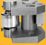
ADVANTAGE Series Load Point with C2® Calibration

Hardy Instruments carries a wide variety of strain gauge load points and scale bases to accommodate your application requirements.